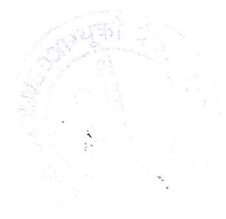
..... Asst. General Manager

The details may be collected from Bank's Zonal Office at Maniram Dewan Road, Guwahati or can be downloaded from our Bank's website at www.ucobank.com . The last date of application in sealed cover on prescribed format is 08/08/2025 upto 05:00 PM .